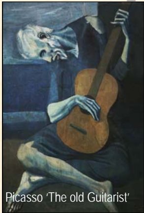
Picasso 'The old Guitarist'

These abstract artworks were inspired by Picasso's guitar sculpture and his paintings. We have started learning about abstract art, cubism and surrealism in art and have been enjoying exploring new ways of creating art.