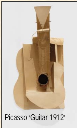
Picasso 'Guitar 1912'