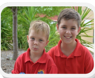
Oakley & Royce