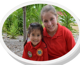
Poppy & Montana